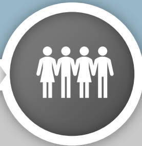
Myers-Briggs Type Indicator

Supporting leadership skills development. Developing emotional intelligence skills through 4 key dimensions: authenticity, coaching, insight and innovation.