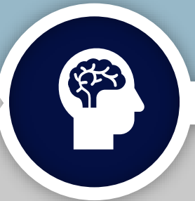
EQi 2.0 Workplace Report

A range of assessments employed in support of culture transformation projects. Understanding current and desired values.