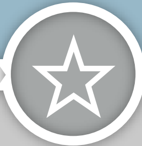
DiSC Talent Insights

An introduction to personality types. Understanding others aids communication and performance.