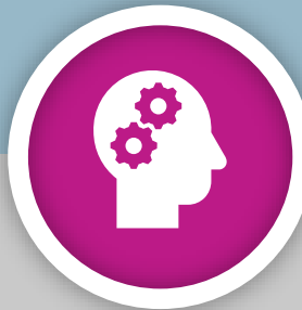
Barrett Values Centre™ | Values Assessments

For information regarding how you can adopt these tools with your teams either through coaching or as part of an integrated development programme, speak to Primeast direct on 01423 531083.