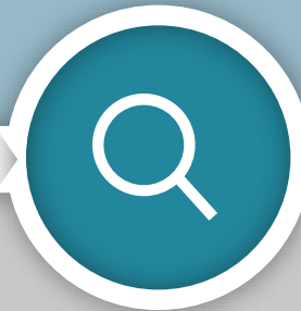
DiSC Workplace Behaviours

A range of tools based on 3 distinct areas: behaviours, driving forces and the integration of these.