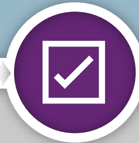
Thomas Kilmann Conflict Styles

Supporting job design and recruitment to aid retention, productivity and job satisfaction.