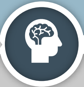
EQi 2.0 Leadership Report

Developing emotional intelligence is critical for leaders today. EQi 2.0 is the leading EQi diagnostic tool.