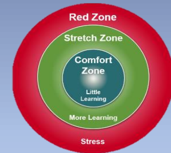
Comfort, Stretch, Stress Model