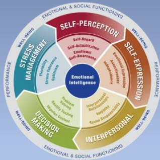
EQi Competencies Wheel